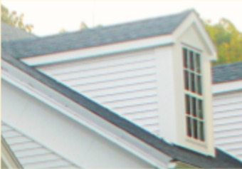
Repaired dormer and new window