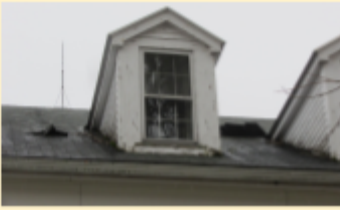
Weathered dormer and window